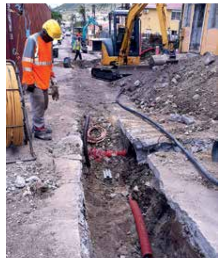
Putting EDF wires and fiber-optic cables underground

In reality, the job starts with the digging of a trench for the electric cables, closing it up, then adding low-voltage cables and making the connections, one by one, street by street, customer by customer, moving from the old overhead wires to the new ones that are underground. Until the last of the 18,000 clients in Saint Martin benefit from this installation, it will be necessary to maintain the overhead wires and all of the electric poles, which are scheduled to almost completely disappear in 2021, unless they also support another network, such as public lighting or telecommunications. This painstaking job, which will have taken over three years, will limit the amount of damage caused by hurricanes. Burying the wires does not guarantee perfection, as